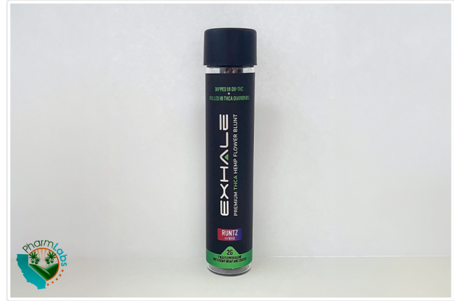
*Dry Weight %